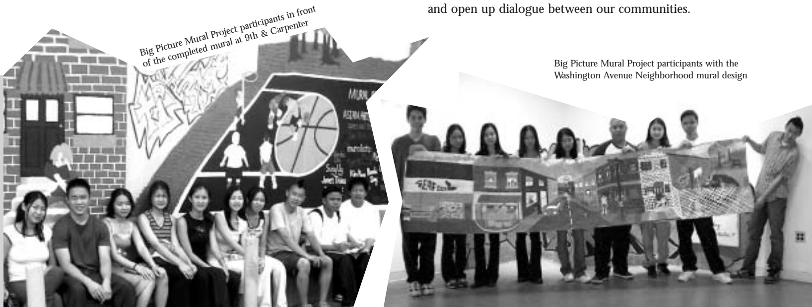
Big Picture Mural Project participants in front of the completed mural at 9th & Carpenter