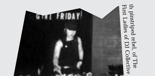
Th pinstriped rebel, of The First Ladies of DJ Collective